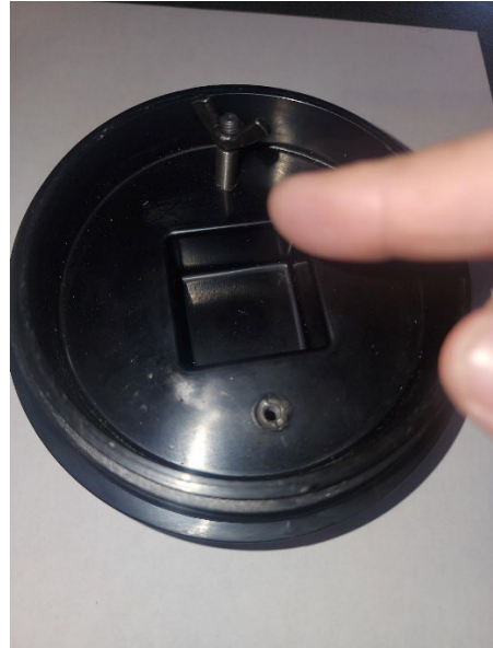
(B) Vertical application post